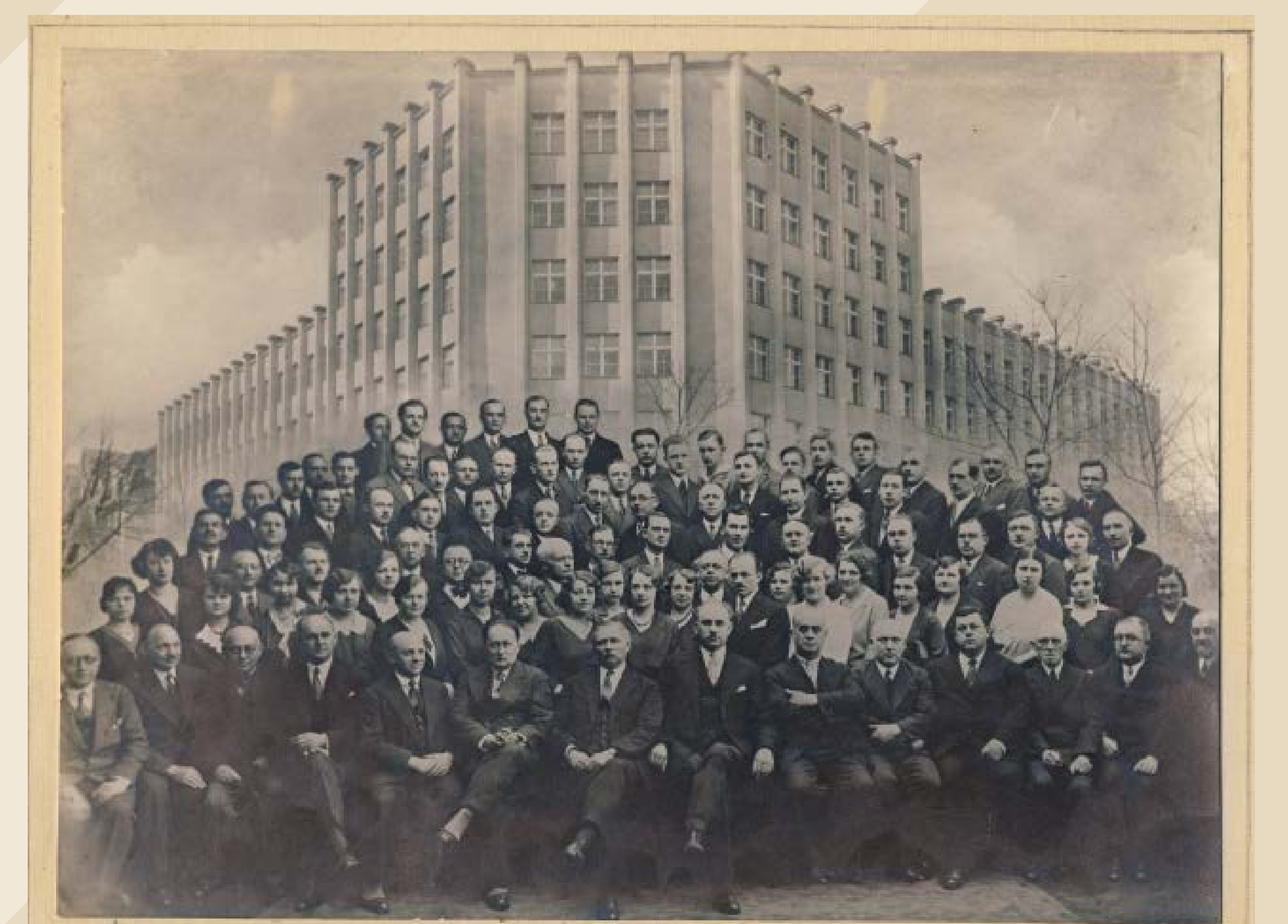
Employees of the White Collar Workers' Insurance Institution. In the background, headquarters of the Institution. Poznań 1930.