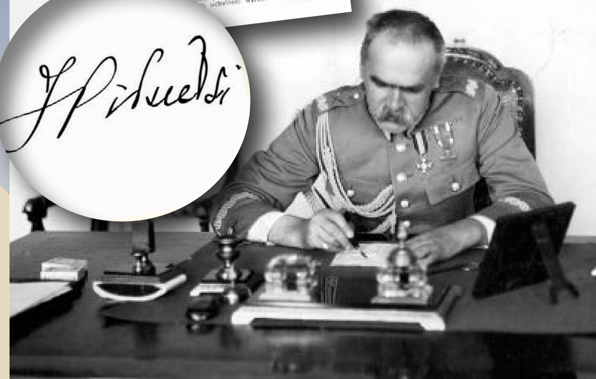
Decree of 11 January 1919 on compulsory sickness insurance was signed by the Provisional Head of State, Józef Piłsudski.