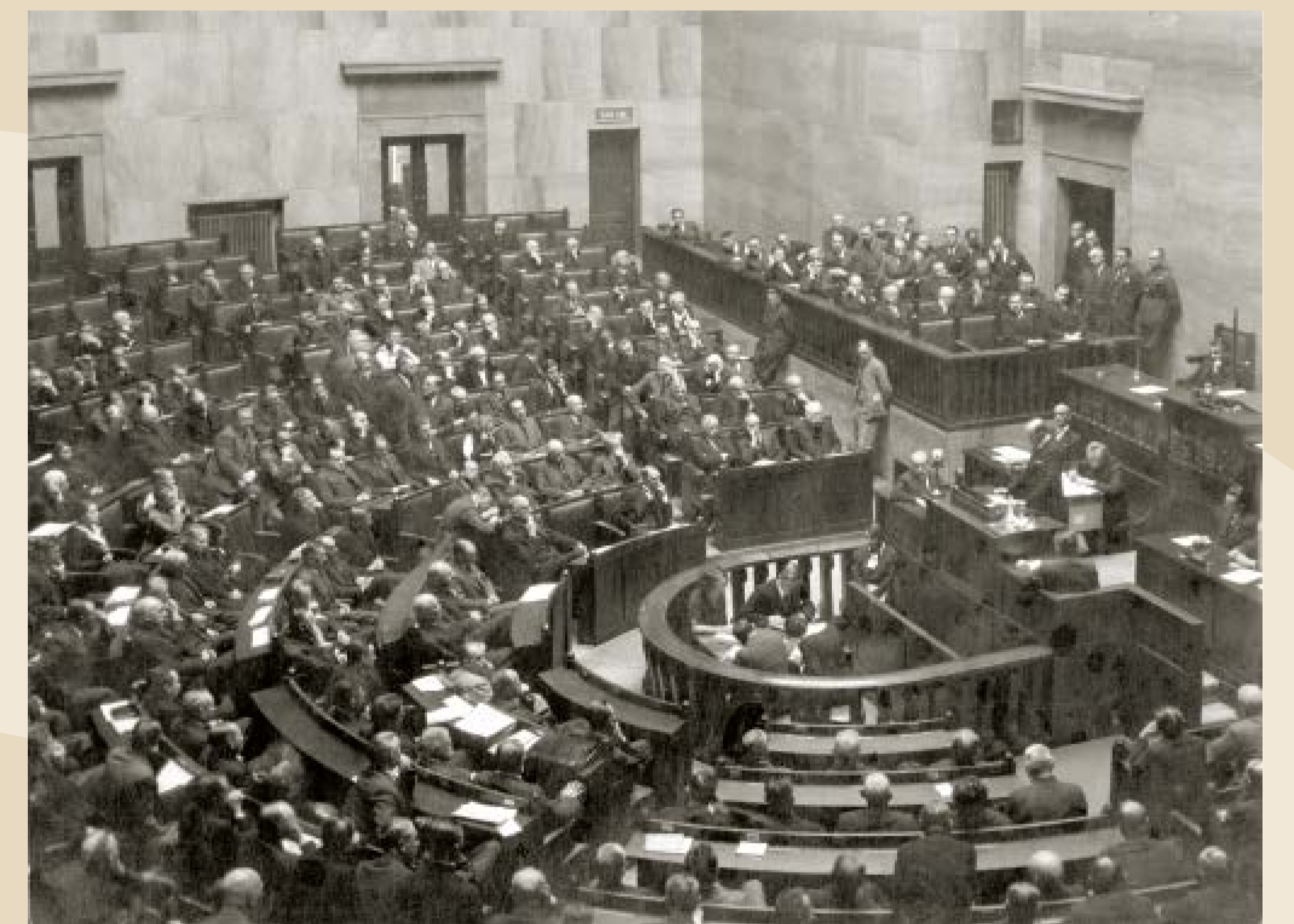
Meeting of the Sejm of the Republic of Poland, Warszawa 1933.