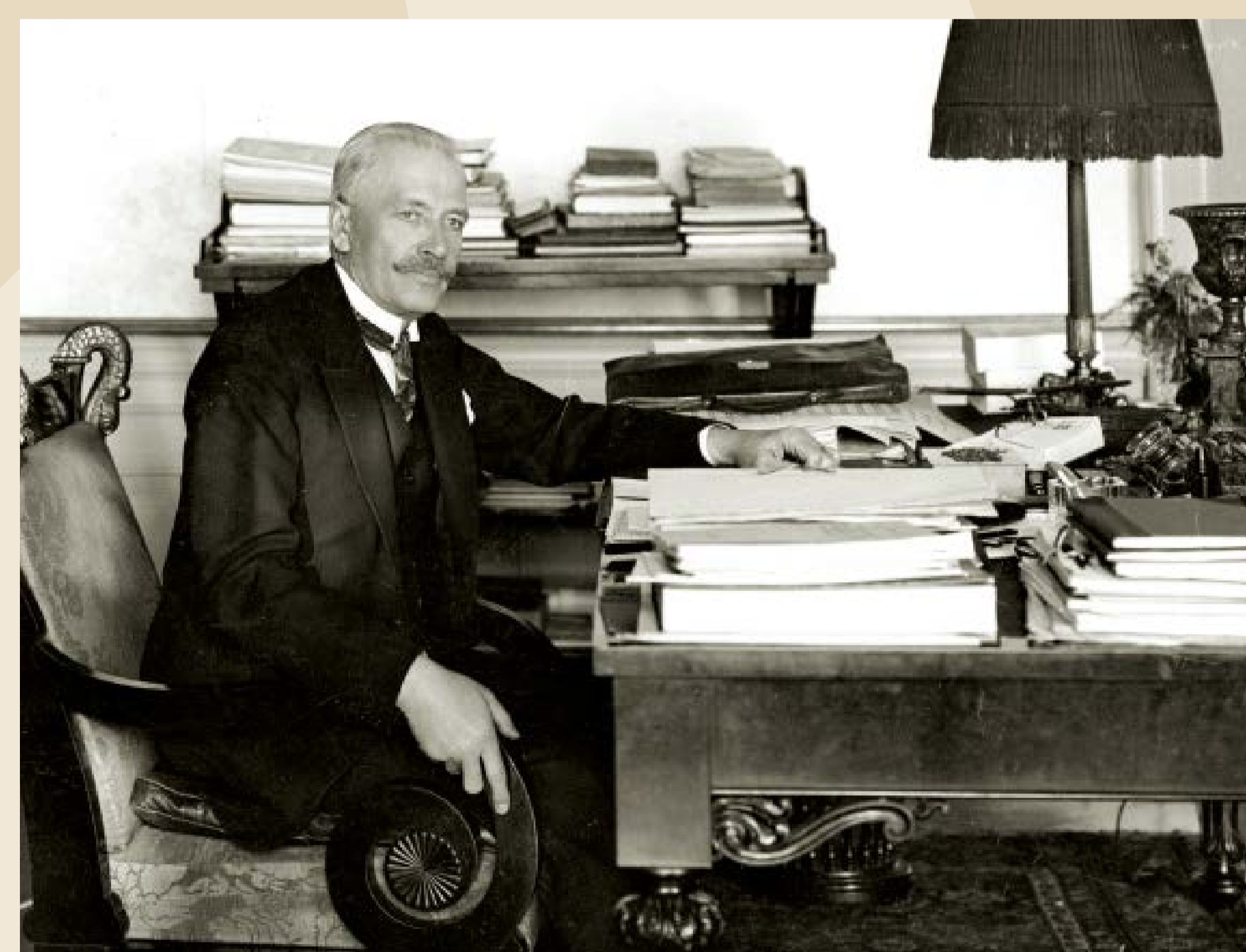
On 24 October 1934, the President of the Republic of Poland, Ignacy Moscicki, signed a Decree establishing the Polish Agency of Social Security.