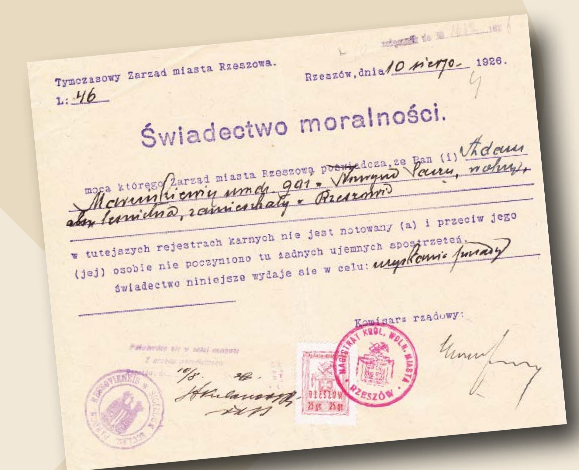
Certificate of morality - one of the documents required for employment in the Social Insurance Company, 1926. ZUS collections, Rybnik Branch