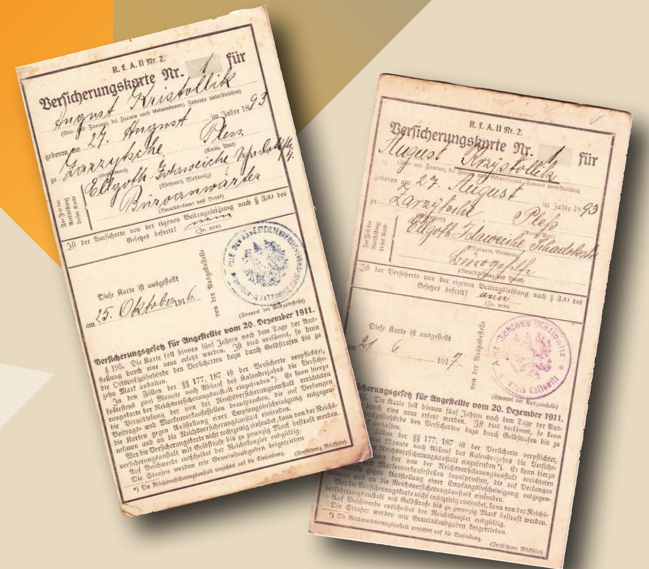
German Insurance Card, 1916.