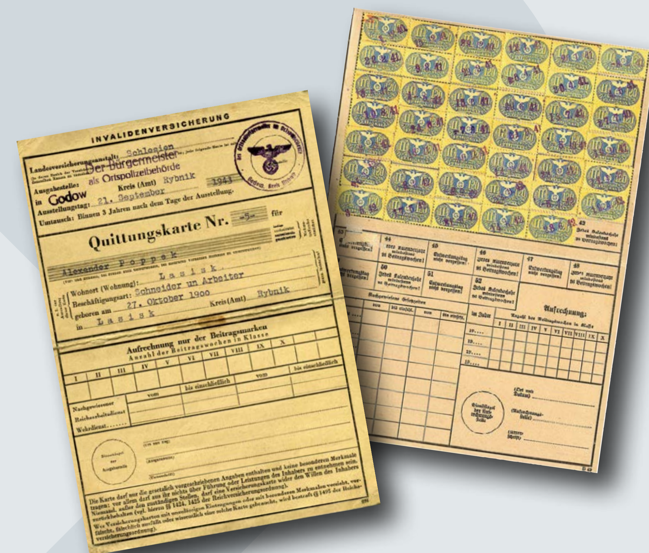
Receipt card confirming payment of compulsory insurance contributions, 1943. ZUS collections, Cęstochowa and Rybnik Branch