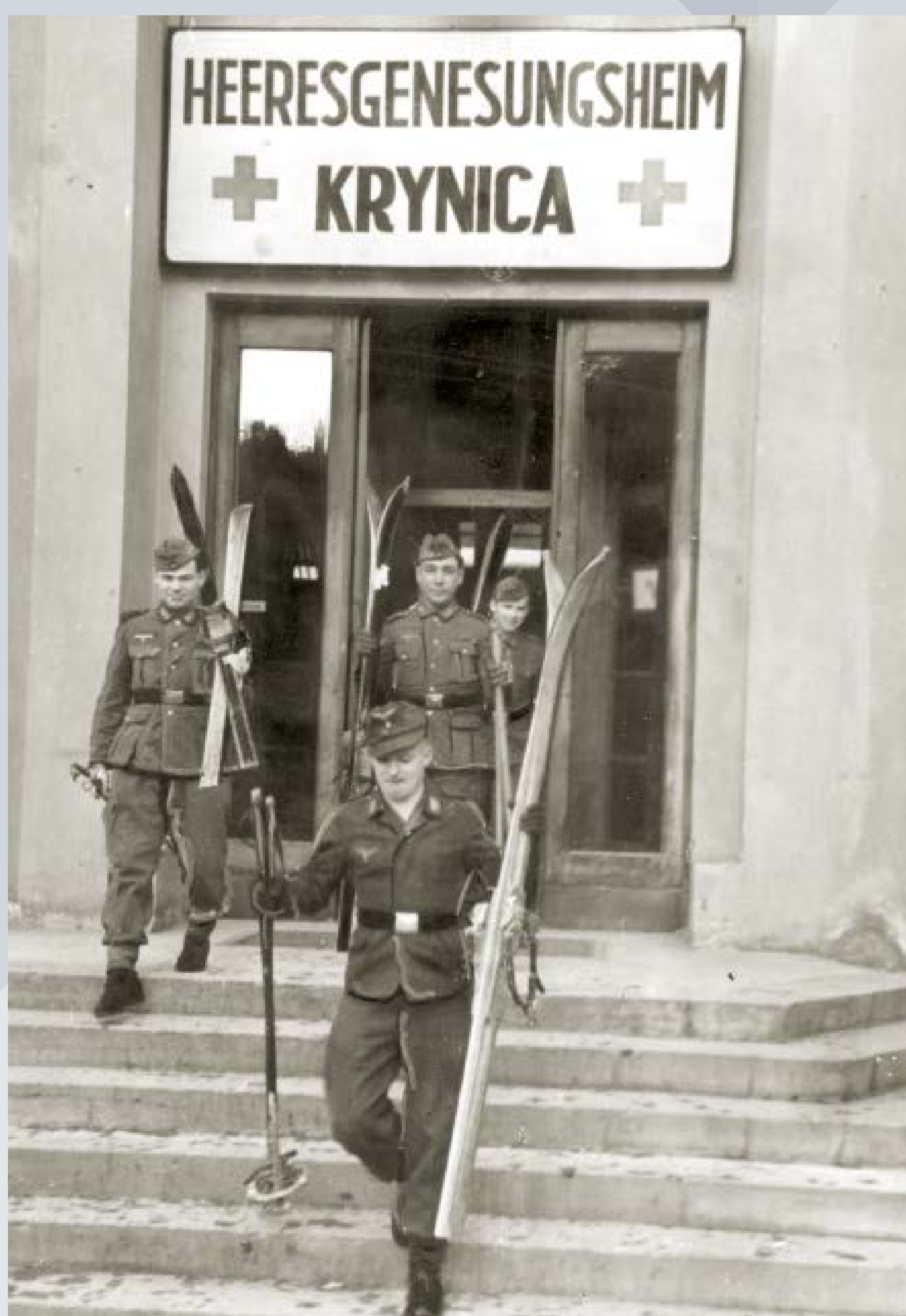
Pre-war Polish sanatorium, in Krynica-Zdrój turned into a German military sanatorium.

During Second World War, the Polish territories occupied by Nazi Germany are divided into two parts. The western part is incorporated into the Third Reich. German insurance legislation is in force in these territories. Poles may only use it to a very limited extent. The Jewish population is practically completely deprived of insurance cover. A General Governorship is created from the other part of the Polish lands (the Kraków, Warsaw, Radom and Lublin districts). ZUS, under the German name Hauptanstalt für Sozialversicherung , operates only in this area. It pays benefits reduced by the occupying forces, provides employment, and social insurance doctors save the health and lives of the sick. Social insurance employees join the independence conspiracy in large numbers. They take part in the Warsaw Uprising with weapons in hand.