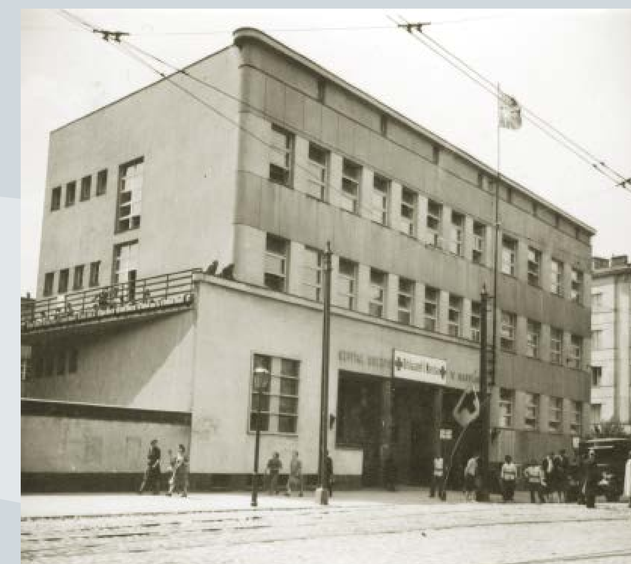
Hospital of the Social Insurance Company at Solec in Warsaw turned into a lazarette for German soldiers, 1944.