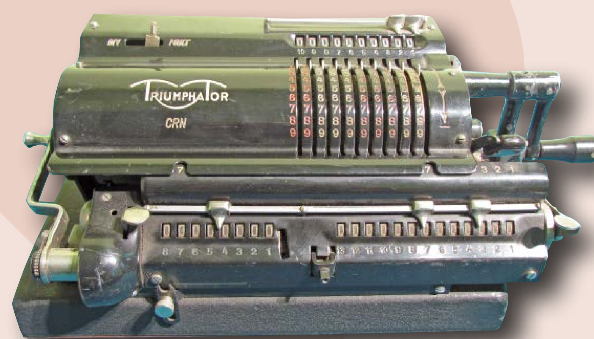
Arithmometer (mechanical computing machine) by Triumphator, Electric computing machine by Supermetall. ZUS employees in the 1940s and 1950s calculated the contributions and benefits due using such machines. ZUS collections, Poznań Branch