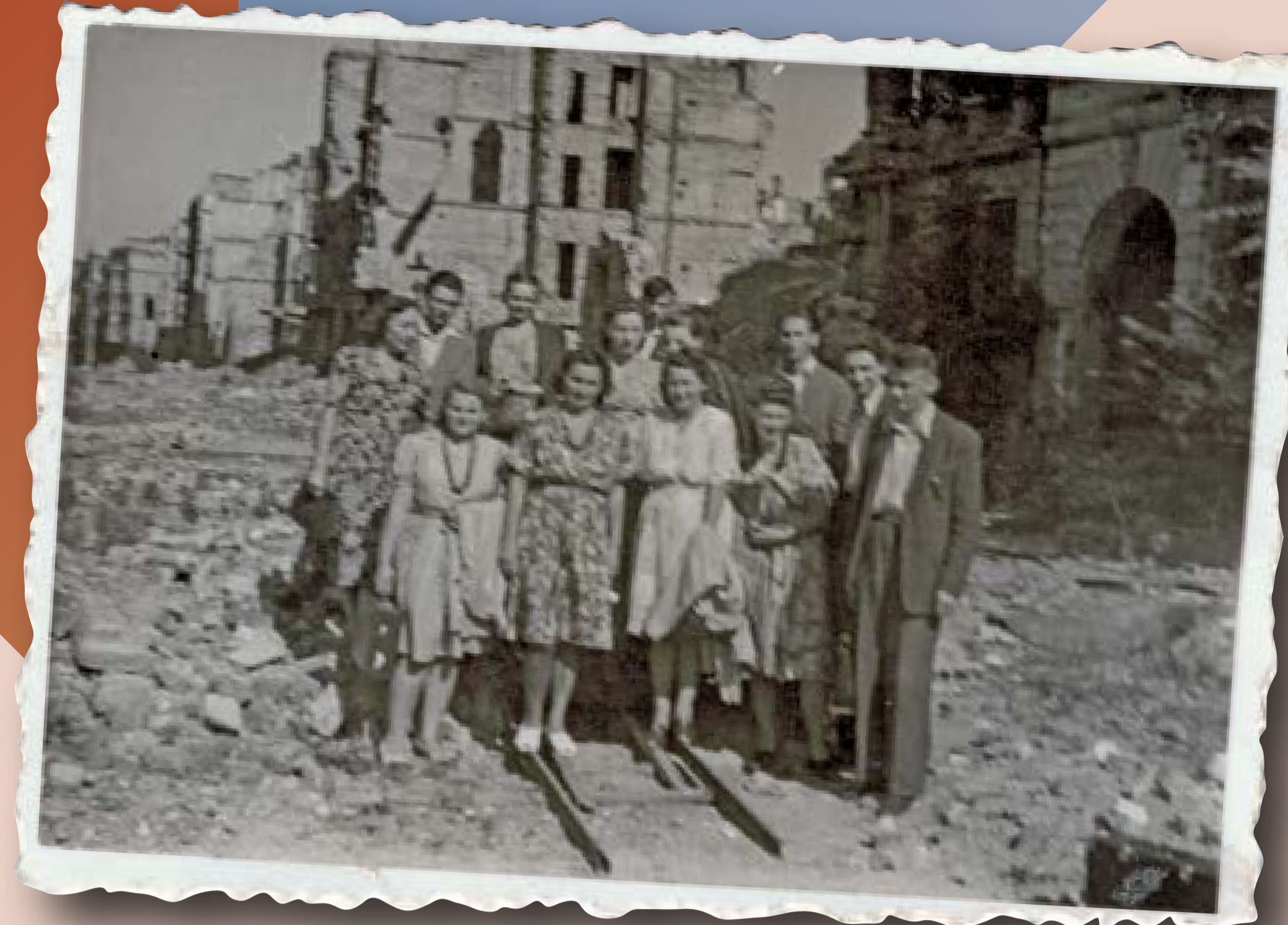
ZUS employees help in removal of the ruins and in reconstruction of Warsaw.