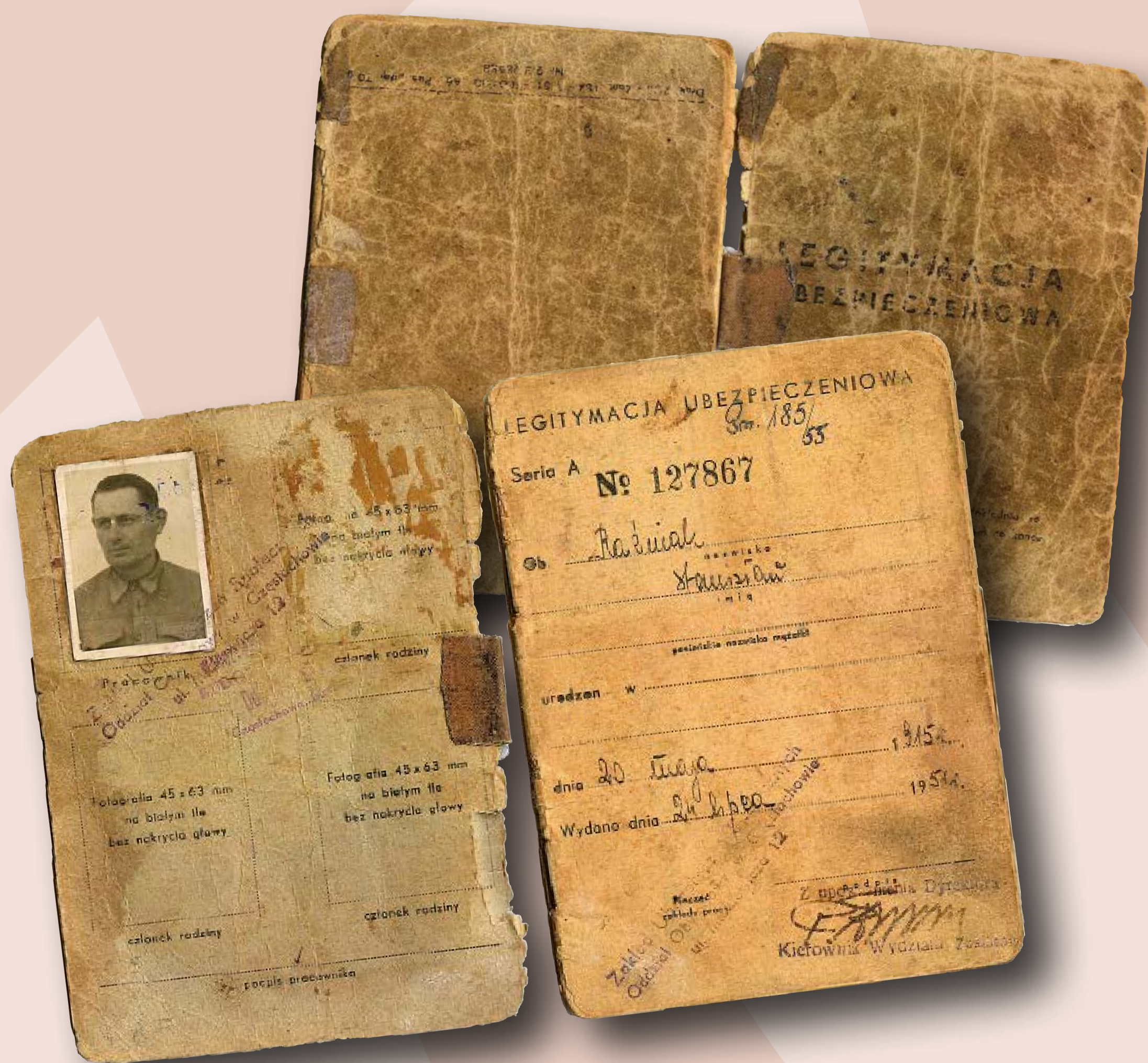
Insurance card from the 1950s.