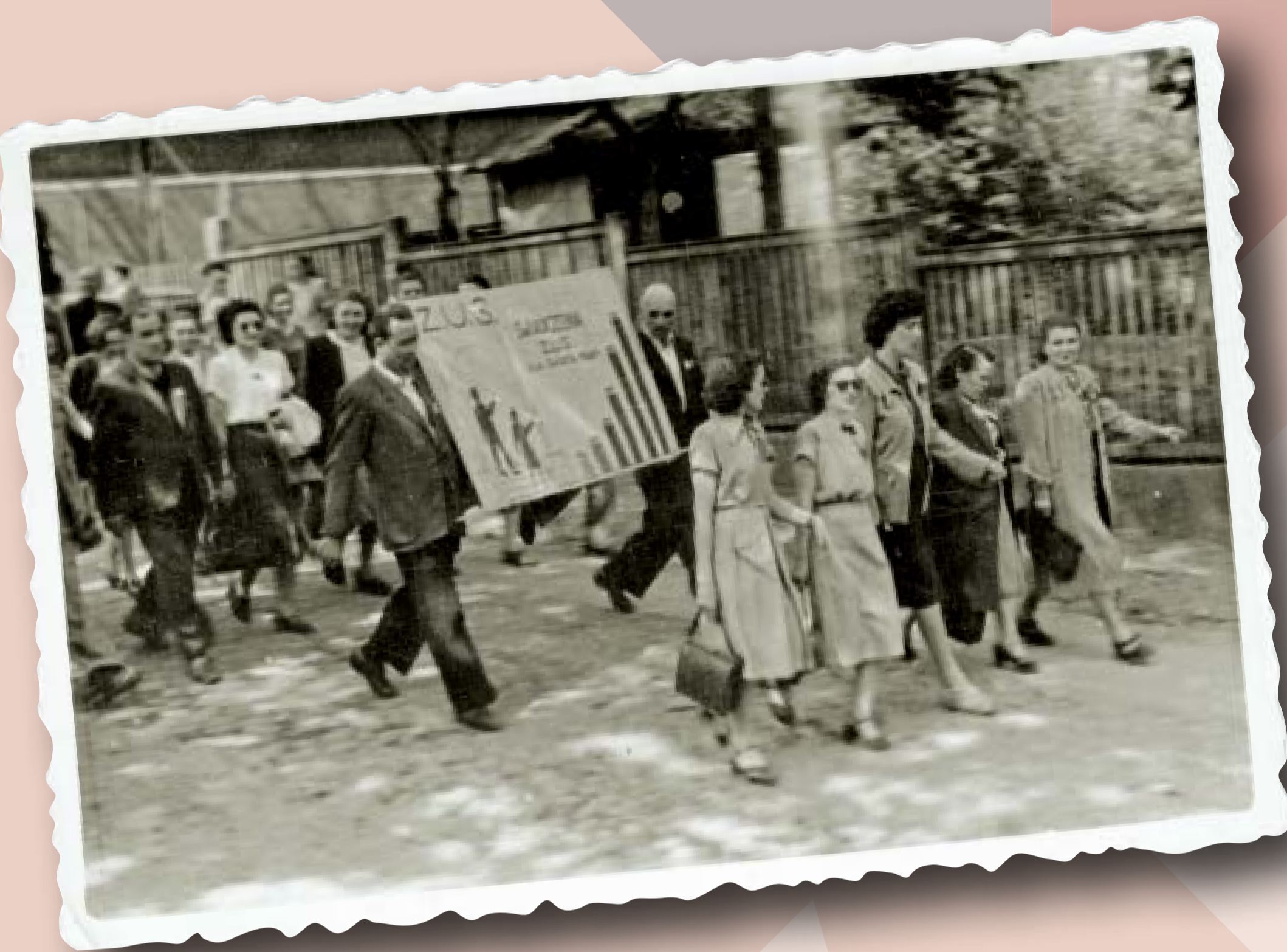
ZUS employees in the May 1 march. After the war, employees of state offices and enterprises had to compulsorily take part in demonstrations in support of the new authorities. ZUS collections, Zielona Góra Branch