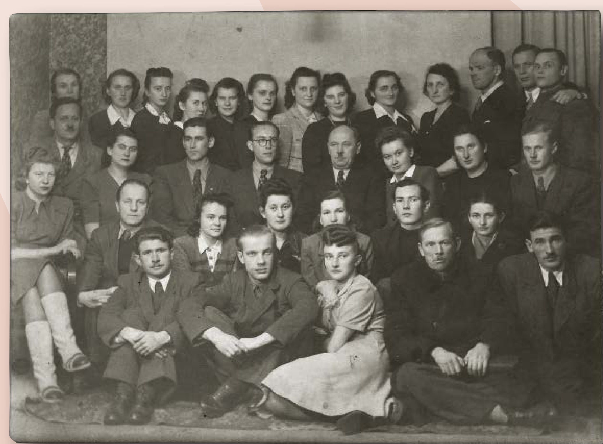
Employees of ZUS branch in Opole, mid-1940s.

After the end of the war, ZUS had to face many problems - huge human losses, material losses, changed national borders. Nevertheless, immediately after the end of the hostilities, ZUS returns to its pre-war activities, starting to cooperate with scientific and research institutions, resuming its popularisation activities in the field of social insurance, and assuming the role of coordinator of the social insurance system. Unfortunately, the new political system of the state did not allow for the independence of the institution, so it was being limited from year to year. In 1950, the Social Insurance Fund is closed down, and in 1955, as part of the centralisation of the economy and state administration, ZUS itself is liquidated. Its tasks in the field of long-term benefits (pensions) are taken over by the Ministry of Labour and Social Welfare, and in the field of short-term benefits (allowances) by the trade unions.