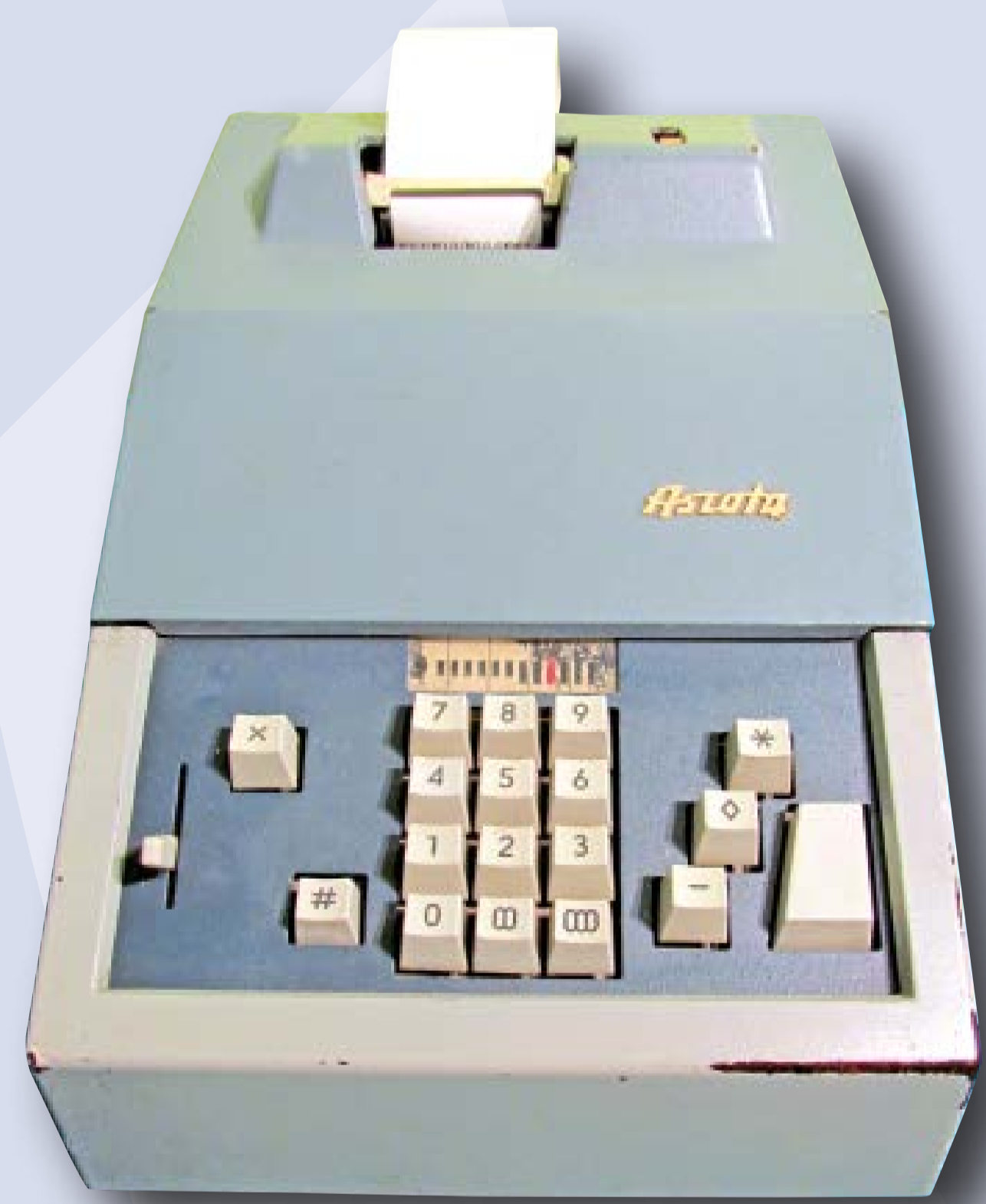
Ascot's accounting machine. ZUS employees in the 1970s, 1980s and 1990s calculated the contributions and benefits due using such machines.