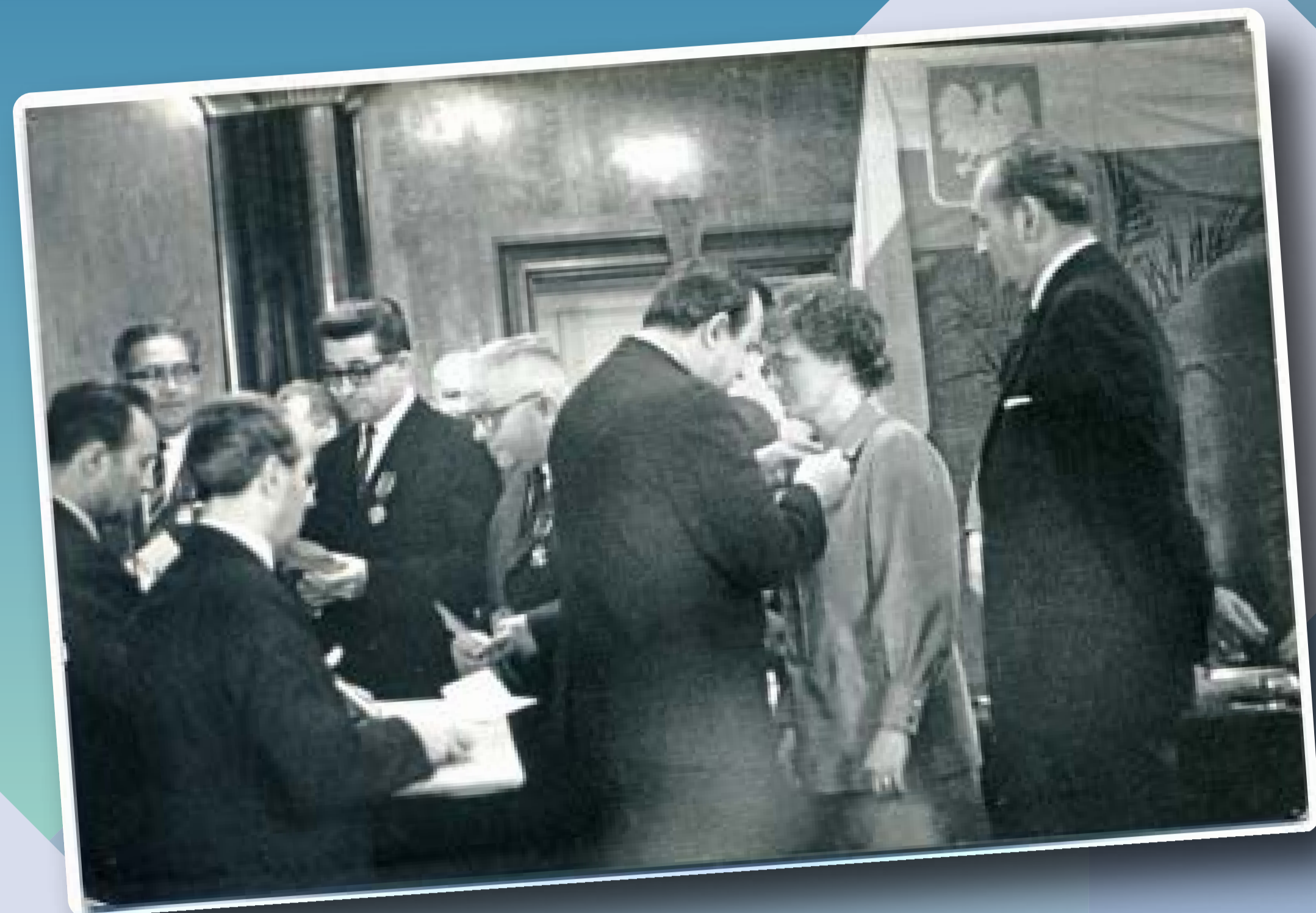
Ceremonial presentation of diplomas and state awards for long service in the field of social insurance on the occasion of the 25th anniversary of social insurance activities in the Polish People's Republic, 22 July 1970.