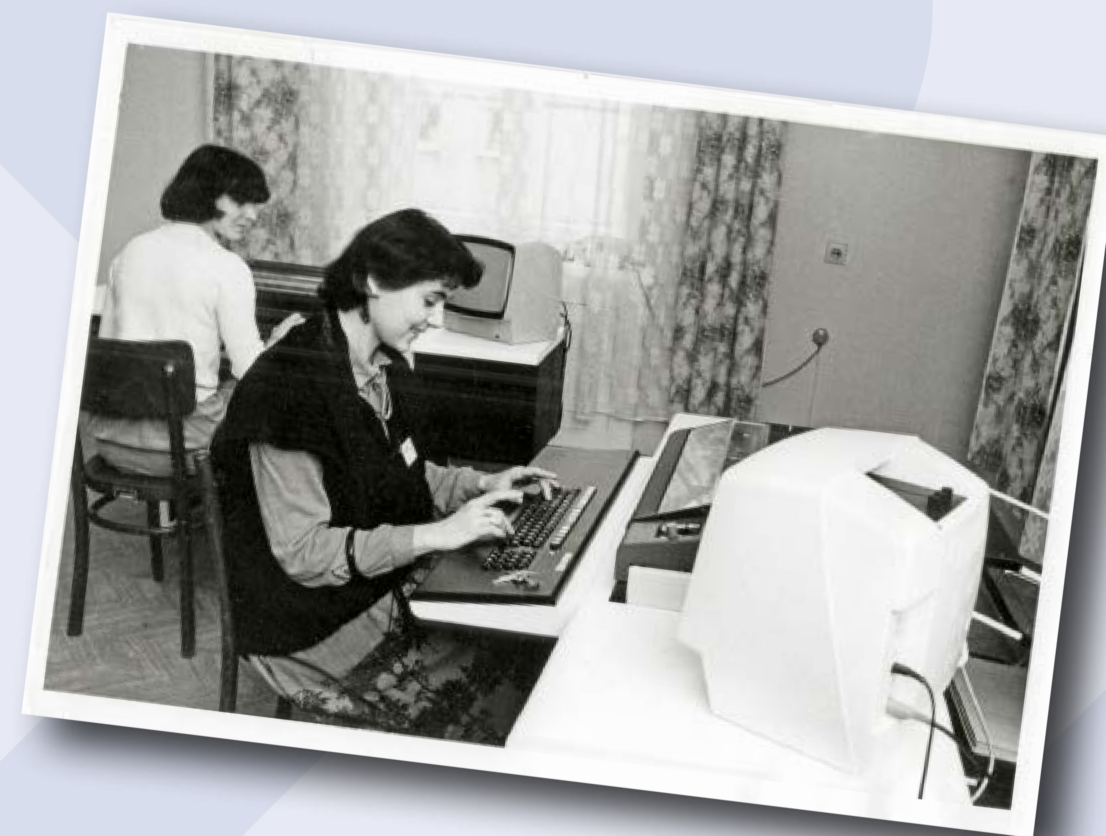
ZUS employee at one of the first computers, 1987.