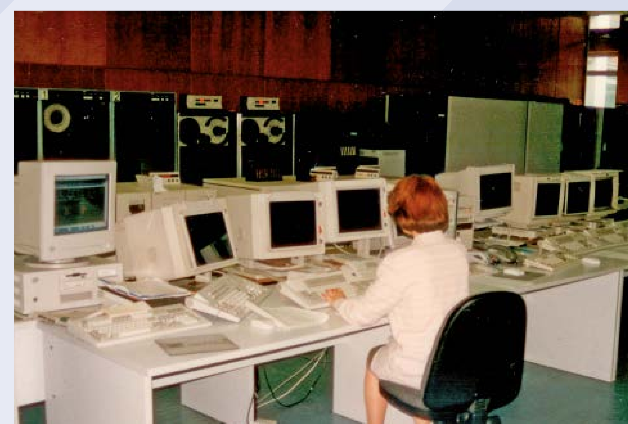
In the late 1980s ZUS makes its first attempt at the insurance system computerisation. The photo shows a computer room in the ZUS Insurance Information Technology Centre.