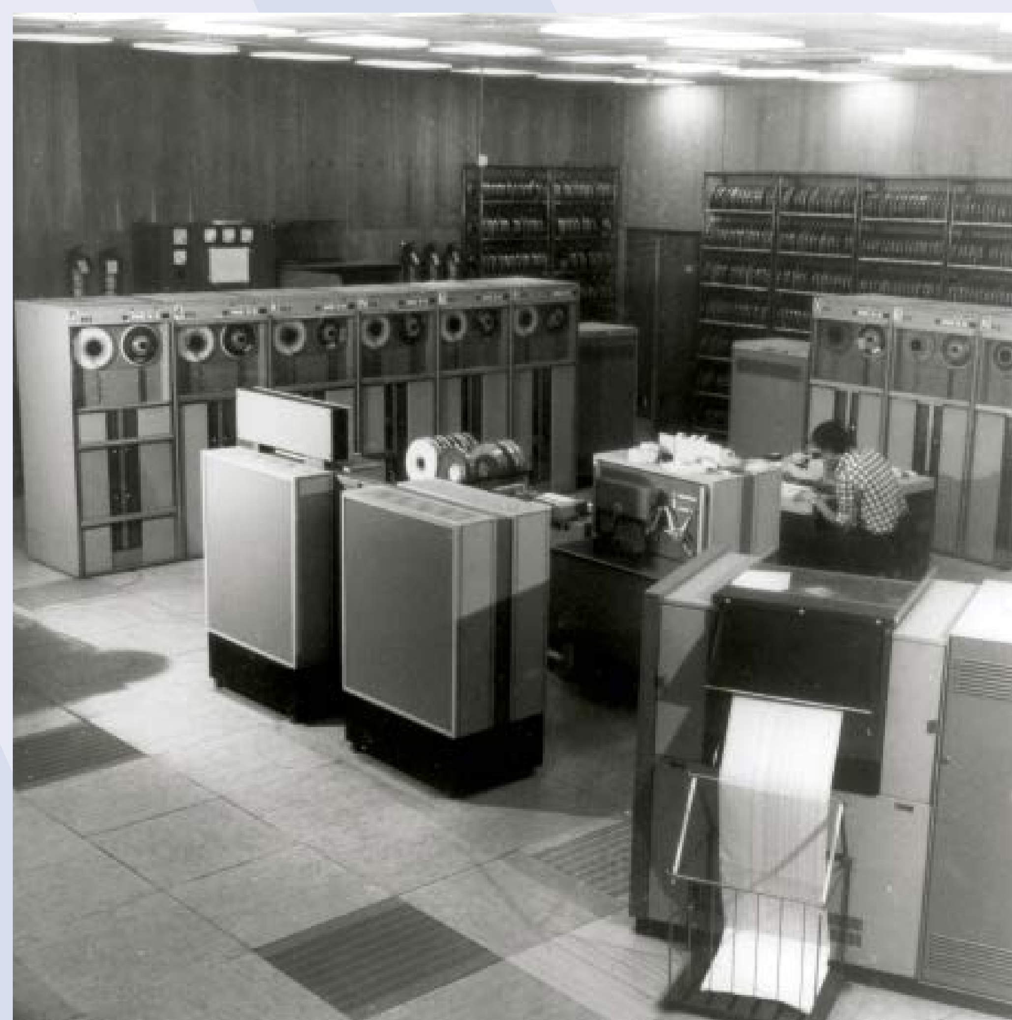
In the 1970s, first electronic computing machines appeared at ZUS. The photo shows the interior of the Department of Electronic Computing Technology.

It soon became apparent that without a governing body, the social insurance system was not functioning properly. Therefore, already on 13 April 1960, ZUS is reactivated and resumes its tasks in the field of insurance system administration. In the next decade, more social groups are being covered by the universal insurance system, and ZUS is also entering into cooperation in the field of insurance with many countries around the world. At the beginning of the 1980s, the Independent Self-Governing Trade Union 'Solidarity' is established, appealing to social justice in terms of the benefits provided by the state. Martial law, imposed on 13 December 1981, halts all manifestations of democratisation and blocks the implementation of 'Solidarity's' demands. The economic crisis of the late 1980s forces systemic changes in the state. In order to ensure the rational financing of benefits, a Social Insurance Fund is created and is managed by ZUS.