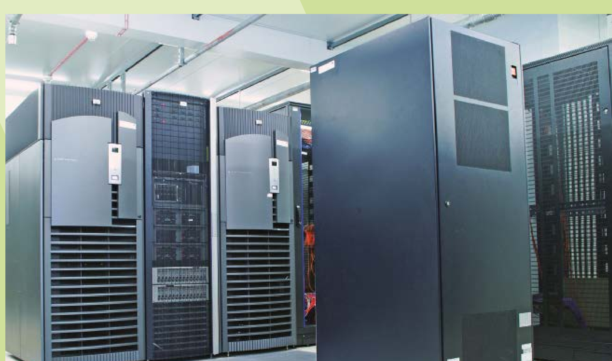
ZUS servers support one of the largest and most advanced technology solutions in Europe. ZUS collections

The turn of the 1980s and 1990s, in addition to the joy of regaining democratic freedoms, also brings the social shock of systemic transformation. Unemployment emerges for the first time after the war. To escape its effects, many people take early retirement. This puts a strain on social insurance funds. The reform of the system becomes necessary. The reform came into force in 1999. At its core is a change in the calculation method of the old-age pension, whose amount would now depend on the total amount of contributions paid, rather than on years of service. For ZUS, this implies the creation of several million individual accounts for the insured. To accomplish this task, a sophisticated IT system is created - Complex Information System (Kompleksowy System Informatyczny, KSI). In the second decade of the 21st century, ZUS is introducing modern management and customer service methods. It is also extending the scope of its electronic services and is carrying out large-scale prevention, education and information activities.