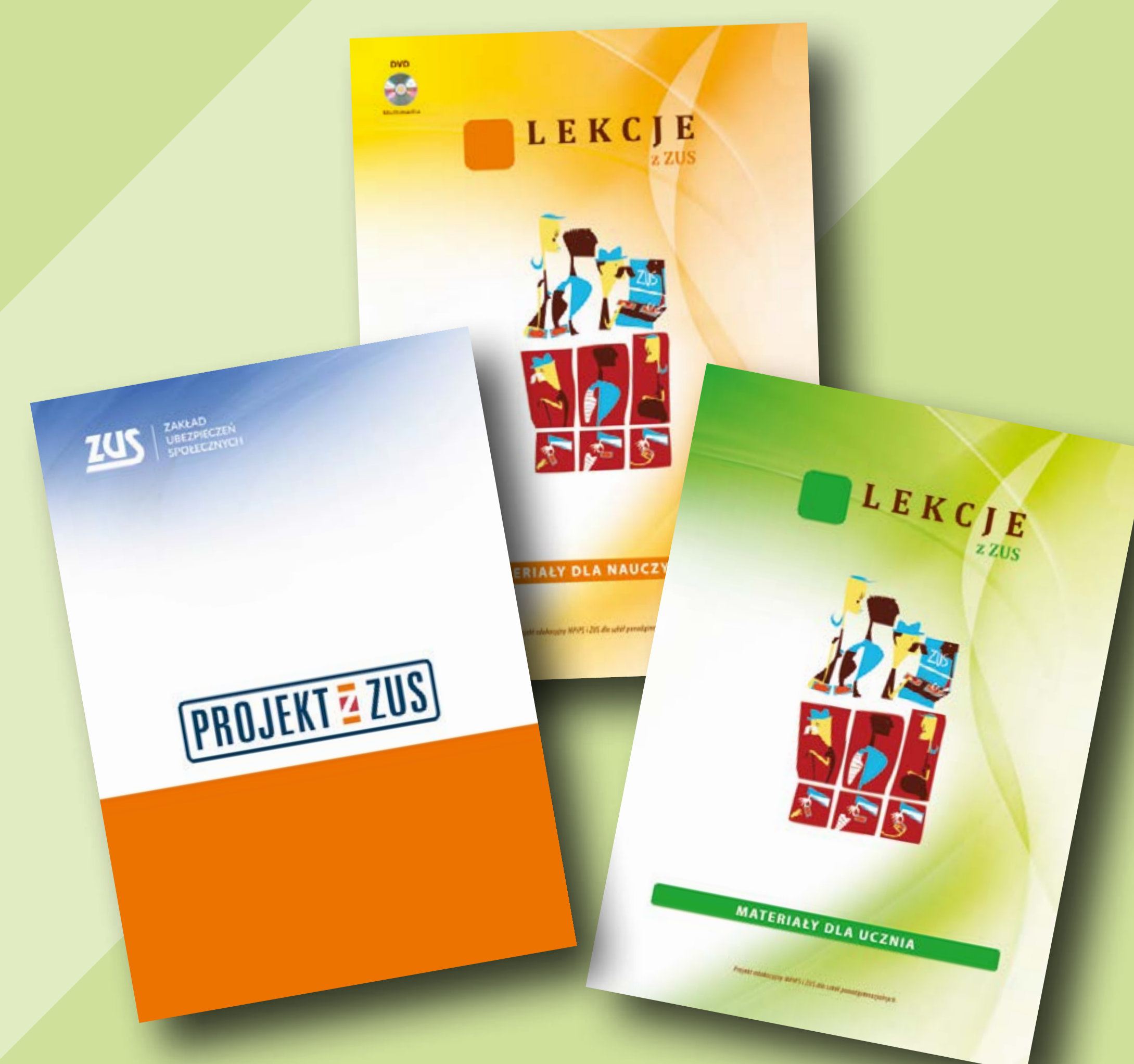
ZUS teaches children and young people about social insurance. The educational materials were prepared by ZUS experts in cooperation with teaching methodologists. ZUS collections