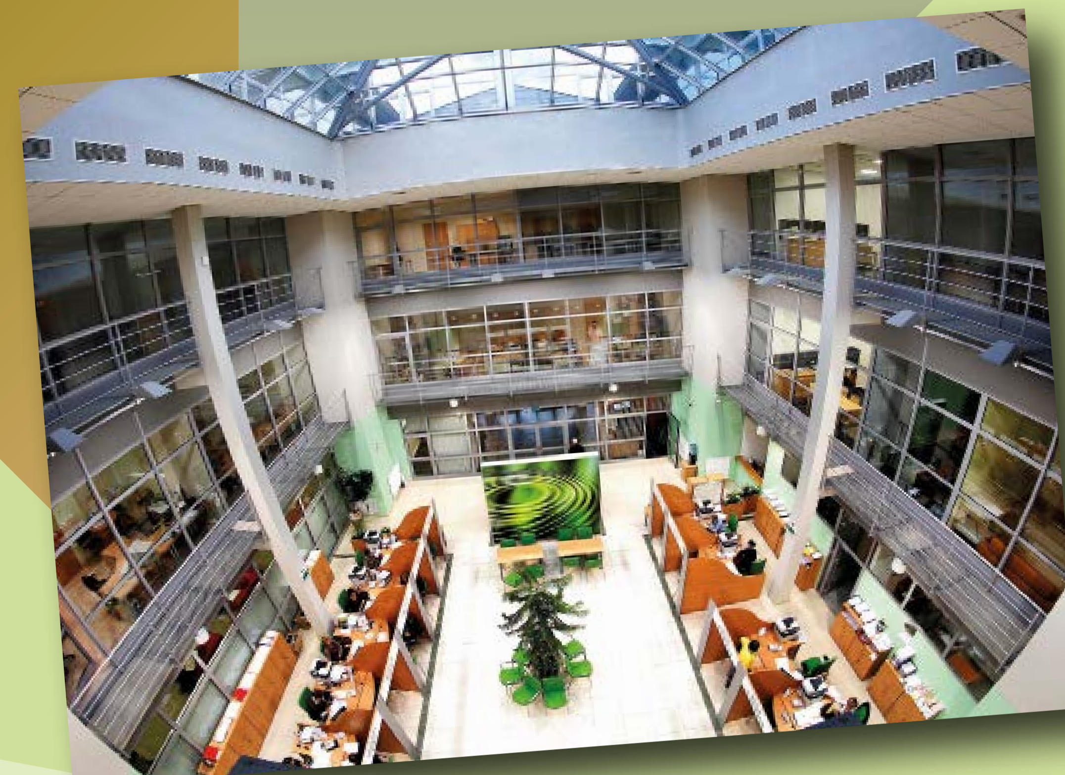
ZUS is introducing modern customer service methods, modernising service halls by organising them in a customer-friendly way. ZUS collections