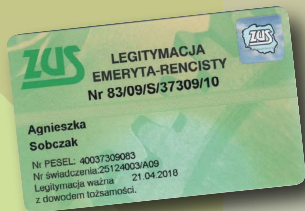
Pensioner ID card from the early 21st century.