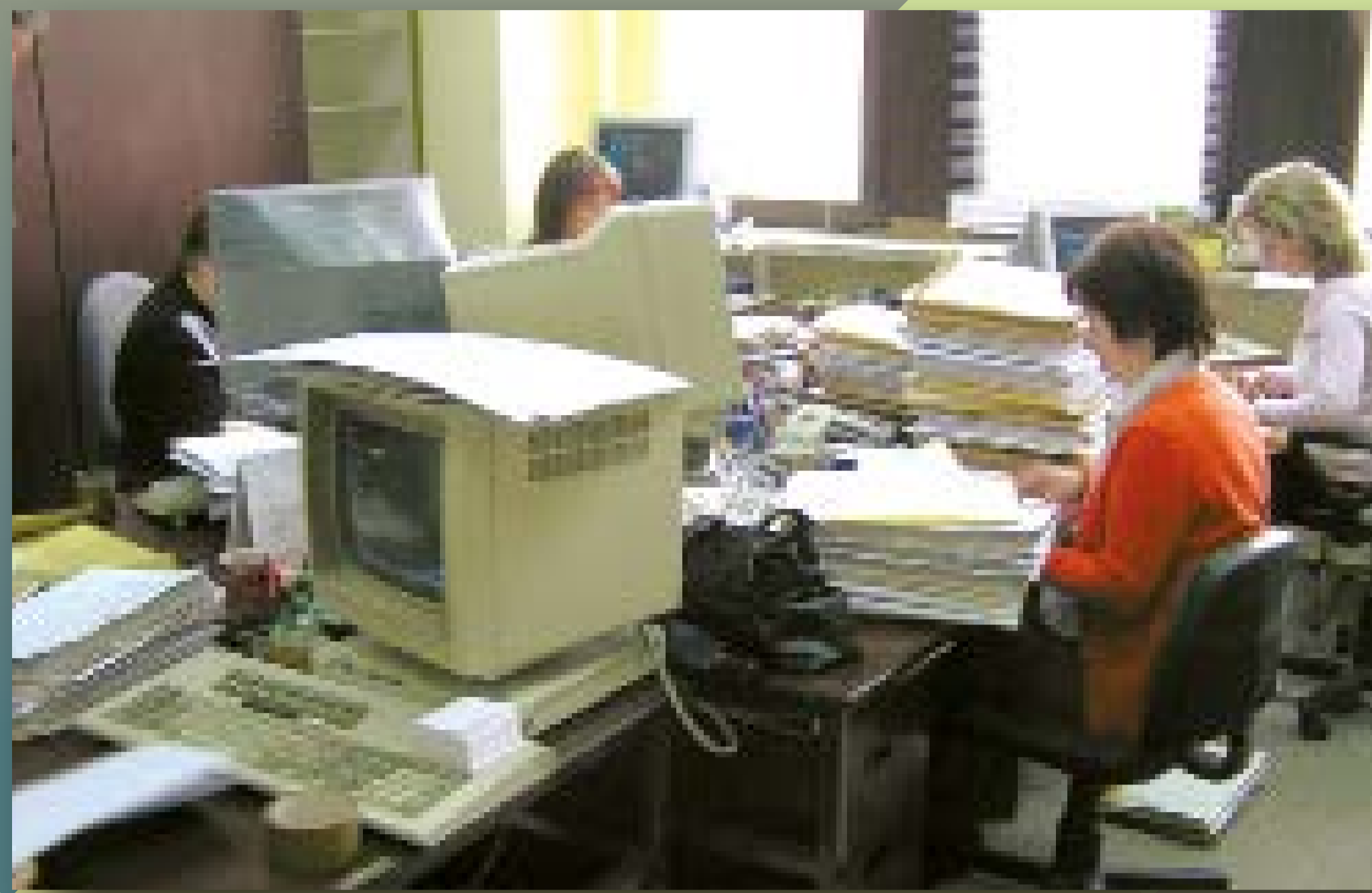
Following the reform of the social insurance system, individual data of all insured persons had to be entered into the ZUS IT system. The photo shows employees of the Pension Records Department in Olsztyn.