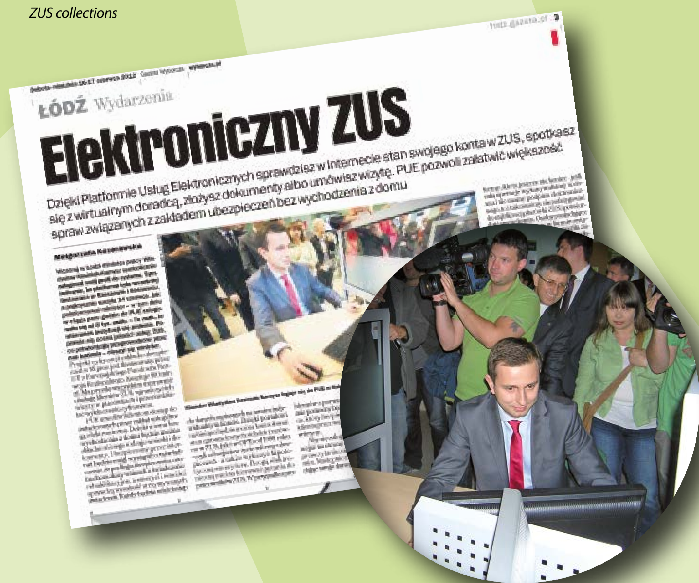
Minister of Labour and Social Policy, Władysław Kosiniak-Kamysz, logs on to the Electronic Services Platform (Platforma Usług Elektronicznych, PUE), the first public administration e-office set up at ZUS. Daily 'Gazeta Wyborcza' of 15 June 2012) 2012